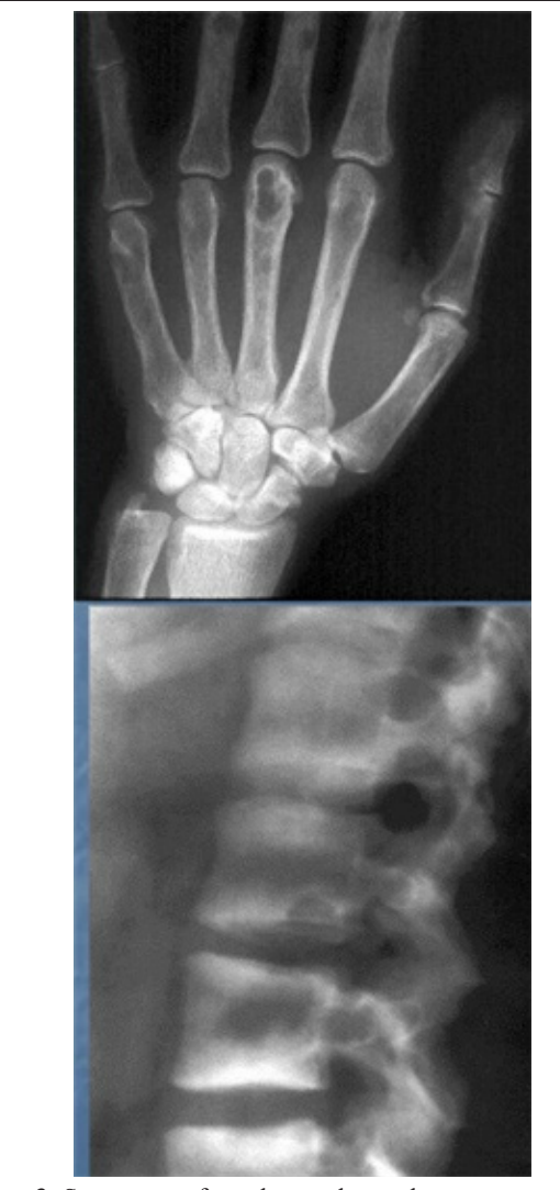
Figure 3. Symptoms of renal osteodystrophy seen as smooth hypodense lesions in bones.

On the basis of the above routine treatment, patients in the control group were treated with calcitriol, that is, instructing patients to take oral administration of calcitriol in fasting state in the morning (Shanghai Roche Pharmaceutical Co., Ltd., SFDA approval number: J20050021), with a dose of 0.5 \mu g each time, once a day. In the research group, patients were treated with calcitriol combined with sevelamer carbonate, in which the treatment of calcitriol was the same as that of the control group. The oral dose of sevelamer carbonate (Genzyme Generals, USA) was 800mg each time, and the drug was administered three times a day. Patients in both groups were treated for six consecutive months.