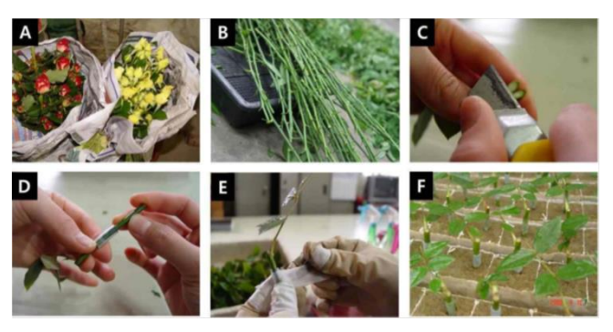
Figure 3. The course of stenting used in Rosa hybrida : A, preparation of harvested scion and rootstock

cutting method. Moreover, higher quality flowers could obtain using the stenting method (4).